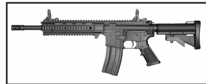
GENERAL VIEW - CARBINE, 5.56MM SEMI-AUTOMATIC, IUR-LE PATROL AMBIDEXTRIOUS